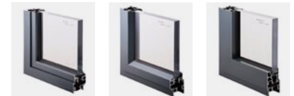
➤ Ovolo ➤ Chamfered ➤ Square

AluK (GB) Limited Newhouse Farm Ind Est Chepstow NP16 6UD +44 (0)1291 639 739